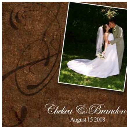
Example of DVD Case Cover