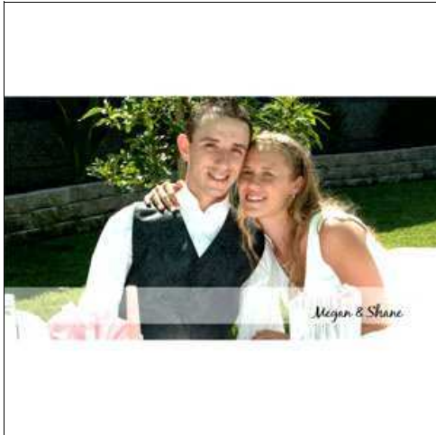
Example of Album Cover

*A proof book is a 10x13 page album with 6 thumbnail photos per page.